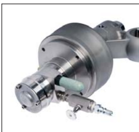
Stainless Steel Air Motor