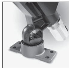
Cup Plate Assembled